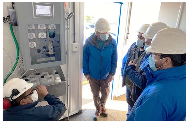
Commissioning and hand-over of the Topaz Iron and Topaz Manganese monitors with the customer.

Seres OL · FR-13730 Saint-Victoret www.seres-ol.com · info@seres-ol.com