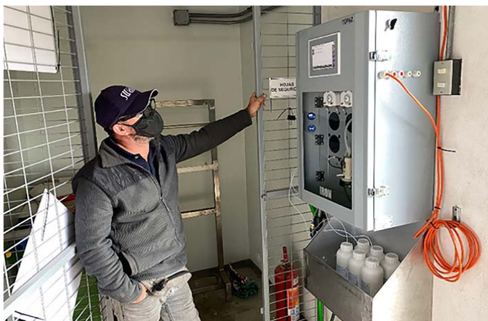
Seres OL Topaz Iron and Topaz Manganese monitors at the customer's site for final product monitoring.

customer wanted to increase the quality security and therefore changed to continuous online monitoring with Topaz Iron analyzer of Seres OL (A Swan company), supplied by the team of our regional office in Chile