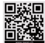
Monitor AMI Silica Data Sheet Nr. DenA25431300