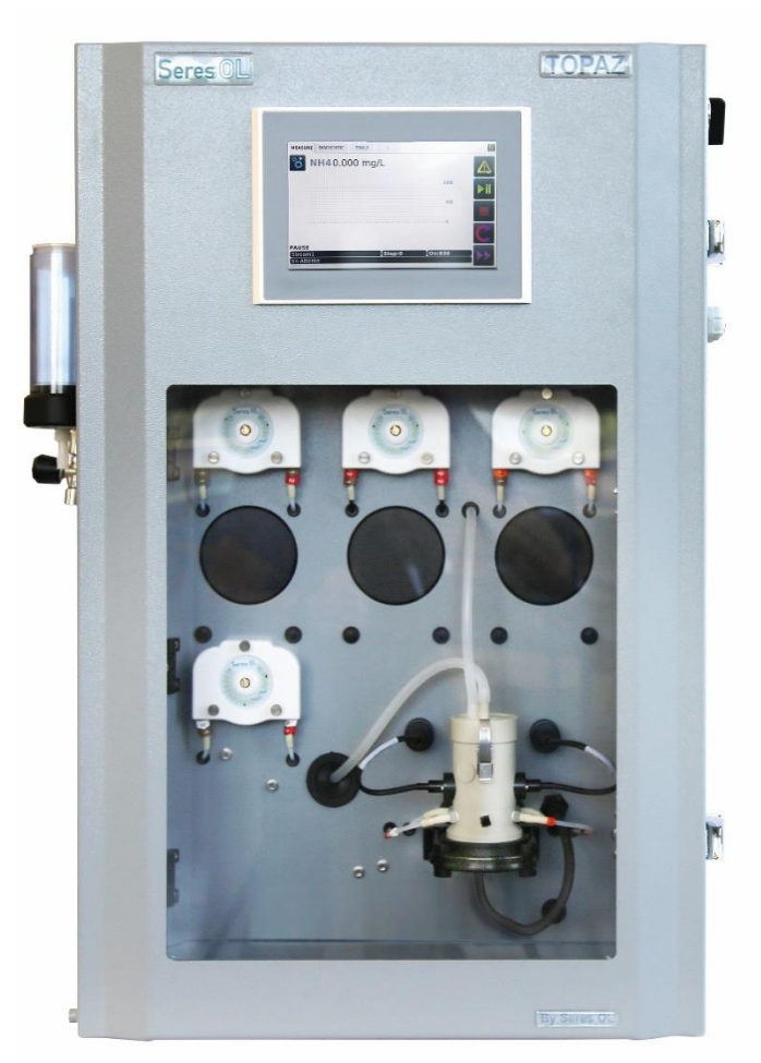
Seres OL Topaz Series Showcase